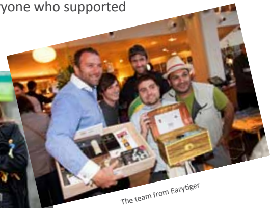
The team from Eazytiger