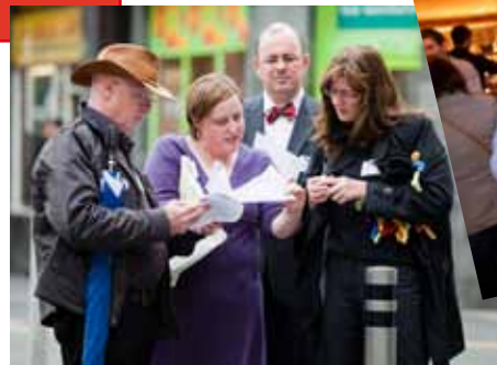
The winning team from Harvey Ingram

Thank you to everyone who has supported our work, including