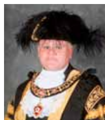
The Lord Mayor, Councillor Robert Wann